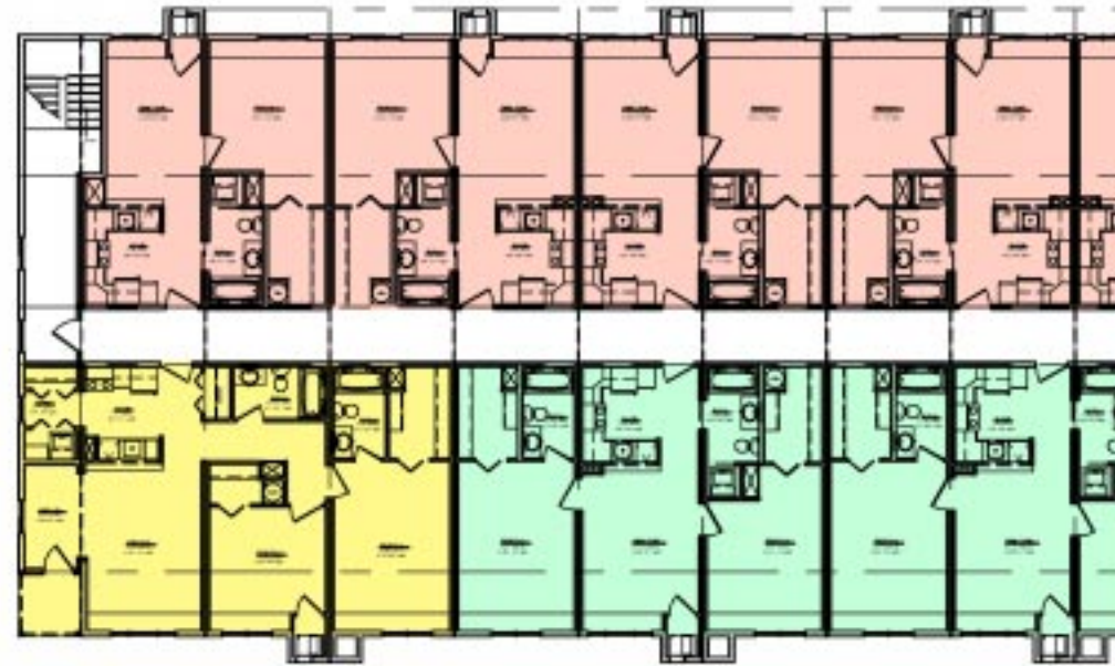
A Unit 1 Bedroom